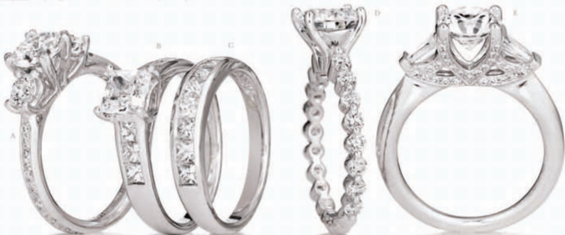
Classic Collection A- Style # 1RZ2056ARP B- Style # 1PC21190FCF C- Style # 21190FCF D- Style # 1RZ7088EP E- Style # 1RZ2264MRP

Showcasing some of BITANI'S most original designs, the Classic collection is for those who value traditional qualities combined with bold new design concepts. From the enduring polished lines, which are indicative of our roots, to the vibrant burst of the color gallery and prongs, BITANI'S Classic collection is simply incomparable.